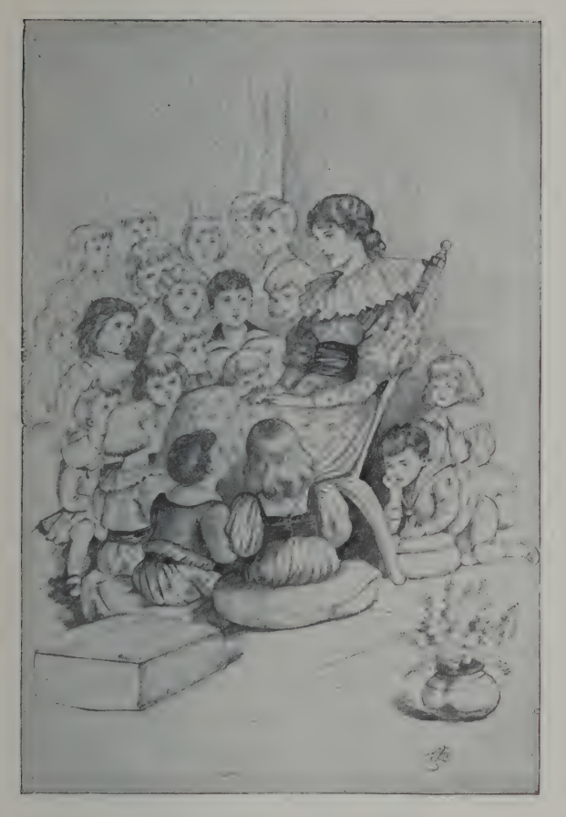
TELLING THE LILAC-BUSH STORY